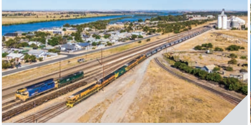
LISTEN & LEARN

Provide resourcing including the right people with the right skills, monitoring and modelling capacity and capability, infrastructure and capital and operating finances.